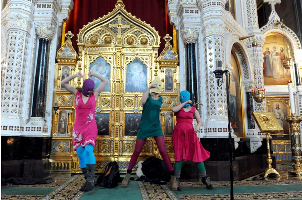
Punk Prayer 'Mother of God, put Putin away' , 2012, high definition digital video, Courtesy the artist and Prudential Eye Awards