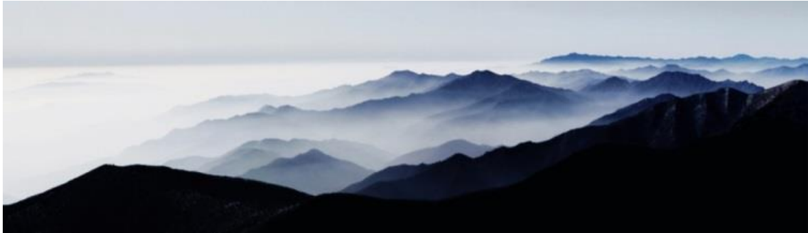
Mt. deokyu 1301 , 2013 archival pigment print on kanji (Korean paper) 50 x 172 cm, Courtesy the artist and Prudential Eye Awards