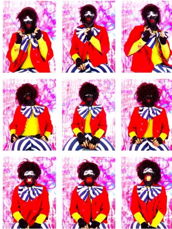
Bravo pour le black clown, 2012, composite photographic print on metallic paper, 256 x 198 cm