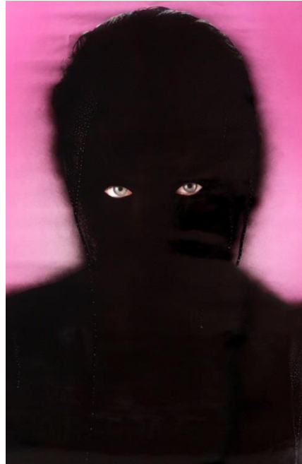
Untitled from the Cover Ups series, 2008, enamel on commercial offset print, 90 x 60 cm, Courtesy the artist and Prudential Eye Awards