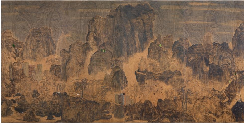
From time to time , 2012, ink, acrylics, charcoal and plastic models on plywood, 245 x 488 cm, Courtesy the artist and Prudential Eye Awards