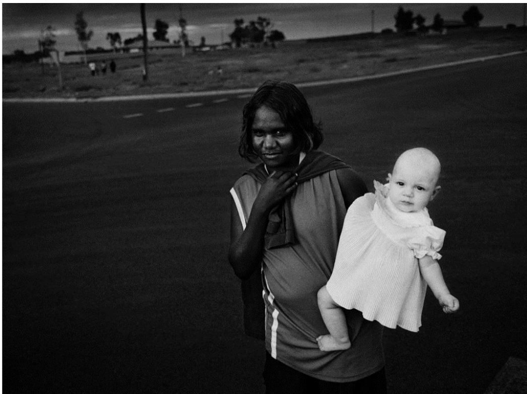
Magnum photos , 2004, pigment print, 98 x 132cm, Courtesy the artist and Prudential Eye Awards