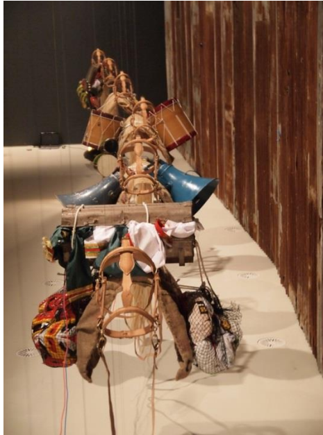
Cortege of the Third Realm , 2012, leather, electronic instruments and found objects, dimensions variable, Courtesy the artist and Prudential Eye Awards