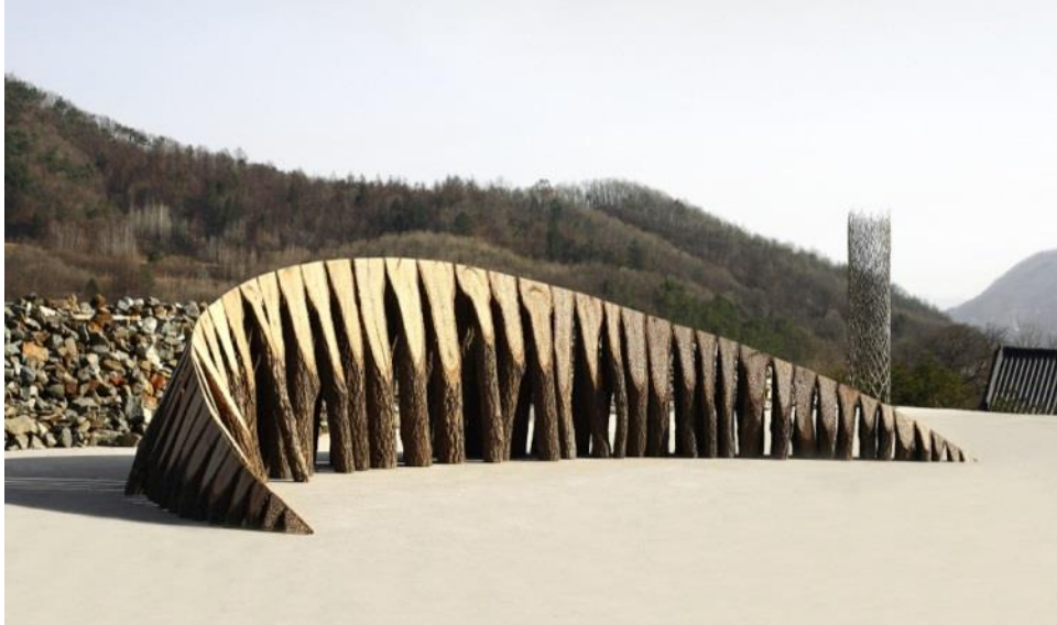
0121-1110=1120210, 2012, Wood (oak tree), 745 x 265 x 150 cm