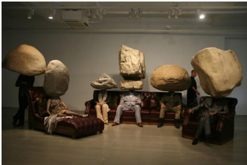
Teenager teenager, 2011, sofas, silica gel, fiberglass, performance