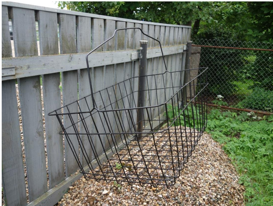
Basket , 2009