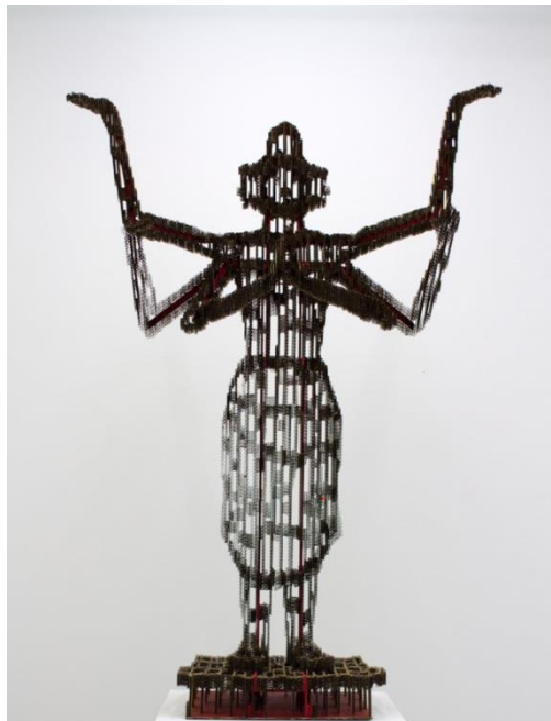
Asura , 2013, used cardboard boxes and mixed media, 168 x 115 x 50 cm, Courtesy the artist and Prudential Eye Awards

For press information and high res images please contact: Sophie Campos or Tefkros Christou at Pelham Communications Tel: +44 (0)20 8969 3959