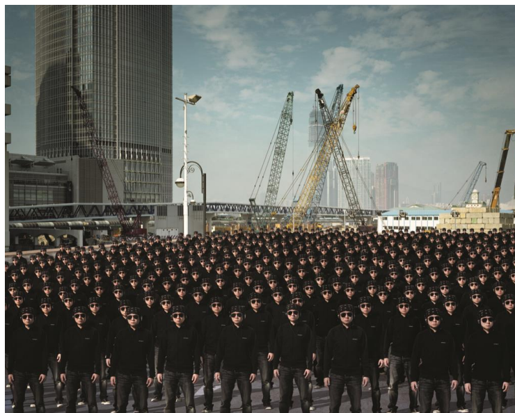
Parade 5 , 2008, archival inkjet print on art paper, 150 x 190 and 244 x 305 cm, Courtesy the artist and Prudential Eye Awards

For press information and high res images please contact: Sophie Campos or Tefkros Christou at Pelham Communications Tel: +44 (0)20 8969 3959