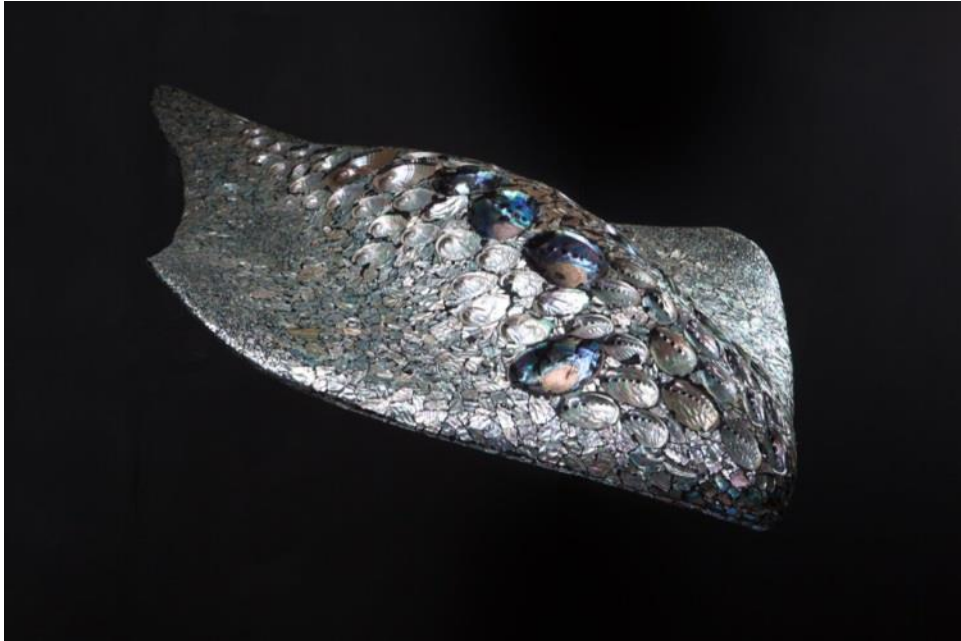
F.o 1-4 , 2012, Abalone, FRP 110 x 180 x 30 cm, Courtesy the artist and Prudential Eye Awards