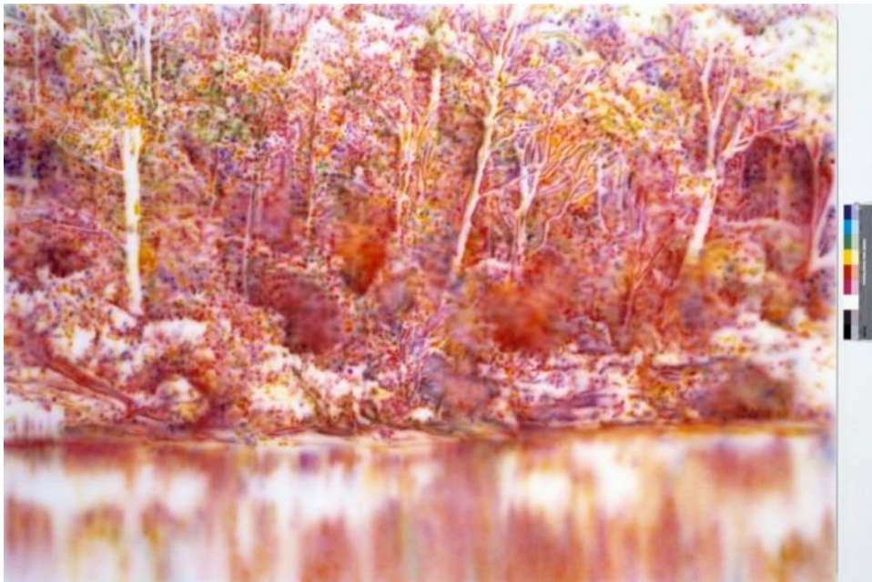
I act as the tongue of you, 2008, acrylic on canvas, 152 x 220 cm, Courtesy the artist and Prudential Eye Awards

For press information and high res images please contact: Sophie Campos or Tefkros Christou at Pelham Communications Tel: +44 (0)20 8969 3959