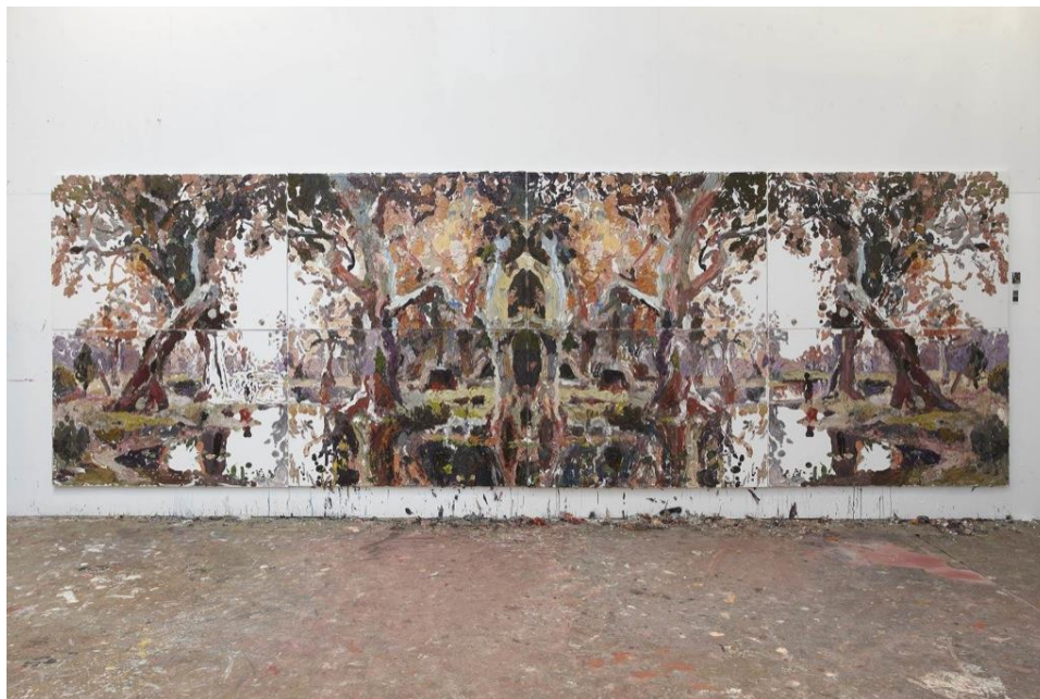
Ben Quilty, Evening shadows rorschach after johnstone , 2012, oil on linen, 230 x 700 cm, Courtesy the artist and Prudential Eye Awards

Installation artists were nominated from China, Korea, Indonesia and Russia. Indonesian Jompot Kuswidananto's politically-charged piece titled The Third Realm , features a brigade of bodiless soldiers equipped as a marching band. The military costumes, musical instruments and boots are lined up ready to march alongside absent, but harnessed horses. Korea's Lee Jaehyo melds his installations into the landscape with an overlarge half-moon crescent of tree trunks and a perfectly spherical globe of tree segments.