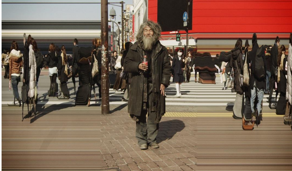
Static No. 19 (Shibuya Rorschach) , 2012, single-channel high definition digital video 16:9, colour, sound , 6 min 3 sec