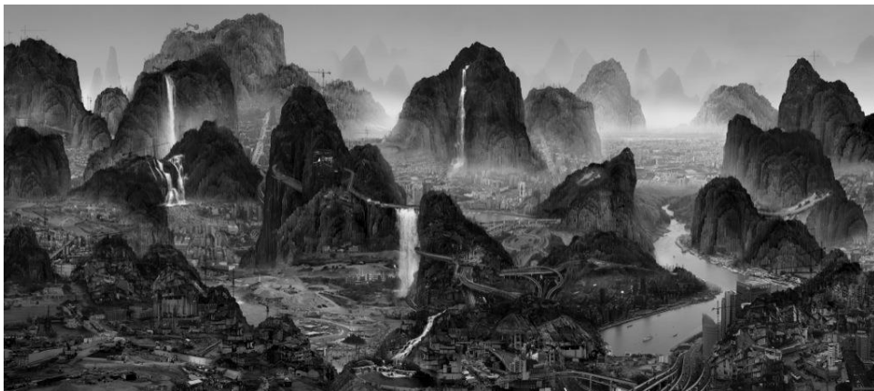
The night of perpetual day , 2013, 4 channel high definition video 9 min, 4320 x 1920 cm

For press information and high res images please contact: Sophie Campos or Tefkros Christou at Pelham Communications Tel: +44 (0)20 8969 3959