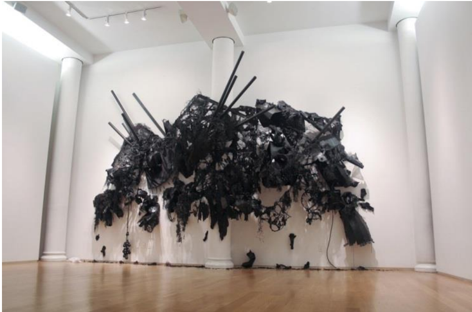
Construction & deconstruction a , 2011, hot melt glue, cardboard paper, wood, aluminium, fabric, plastic and latex paint, dimensions variable