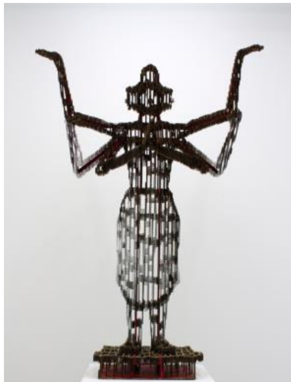
(left) Eric Bridgeman, Bravo pour le black clown , 2012, composite photographic print on metallic paper, 256 x 198 cm, Courtesy the artist and Prudential Eye Awards (right) Yuji Honbori, Asura , 2013, used cardboard boxes and mixed media, 168 x 115 x 50 cm, Courtesy the artist and Prudential Eye Awards

The winners of each category along with one overall winner will be announced on 18 January 2014 at an awards ceremony in Suntec City, Singapore.