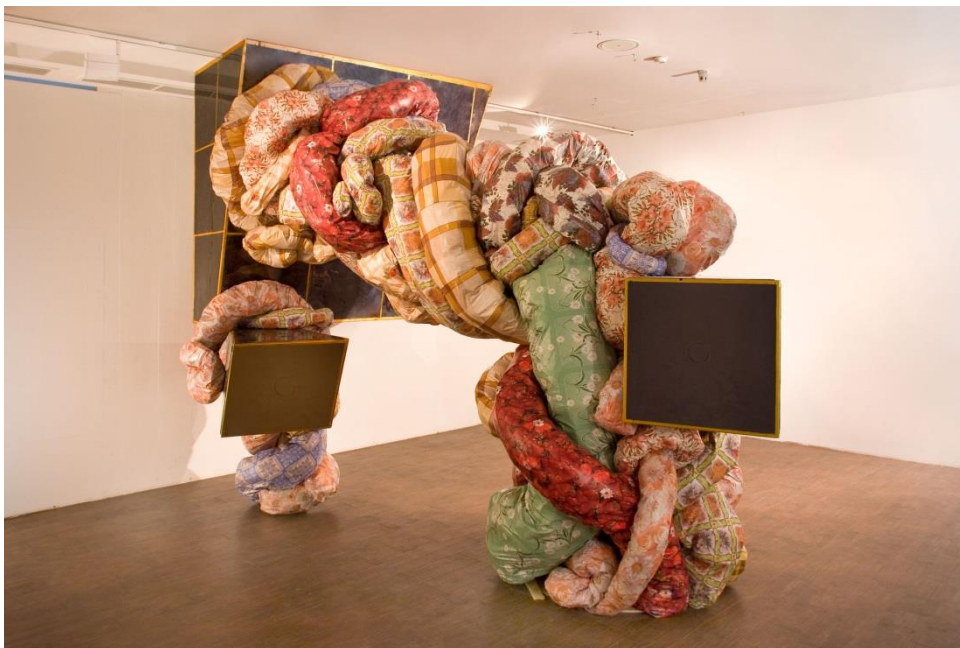
Night time rate, 2009